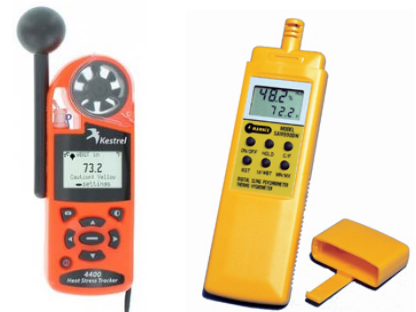
Examples of WBGT monitors